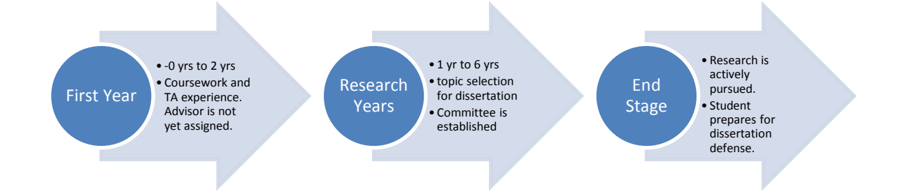
Figure 1. A graduate student's matriculation stages during PhD completion (Stuver, 2006).

During the above referenced stages, doctoral students may be fortunate enough to finance their education through assistantships and grants or they may use student loans as a means to support themselves (and possibly their family) while paying tuition (Jones, 2013). While progressing through their program, students may run into personal or professional circumstances that cause them to reconsider their decision to earn a PhD. According to Di Pierro (2012), "students may abandon their programs of study for many reasons; however, most do not leave due to lack of competence" (p.30). These reasons can be financial in nature or maintaining a work/life balance becomes too taxing on the doctoral student and his/her family (Marcus, 2007).