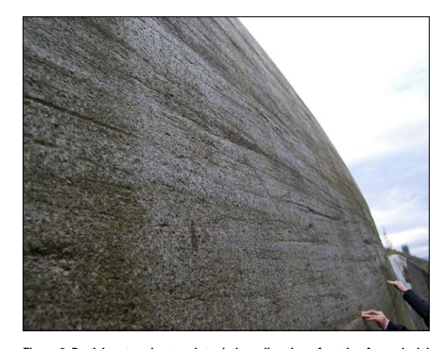
Figure 2. Participants using touch to deduce direction of motion from glacial striations at Stawamus Chief.

...oftentimes when I'm in the field, I get really—you know, it's certainly a full sensory experience. And one of the things that I find being autistic is that ... is I can see things, or I can hear things, but I can't process those two pieces of sensory information simultaneously.