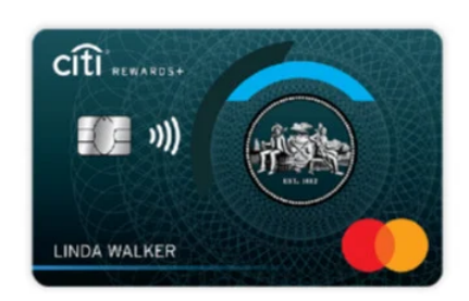
Round up to the nearest 10 points on purchases.