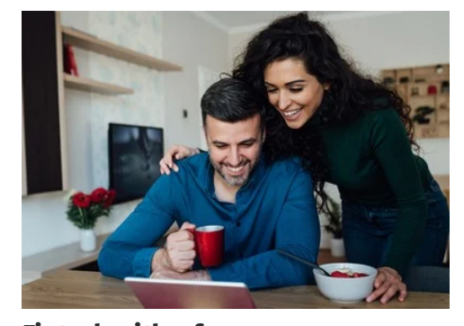
Fintech with a face