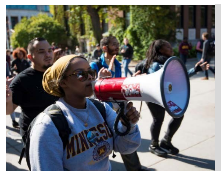
Campus Protest March against Hate speech