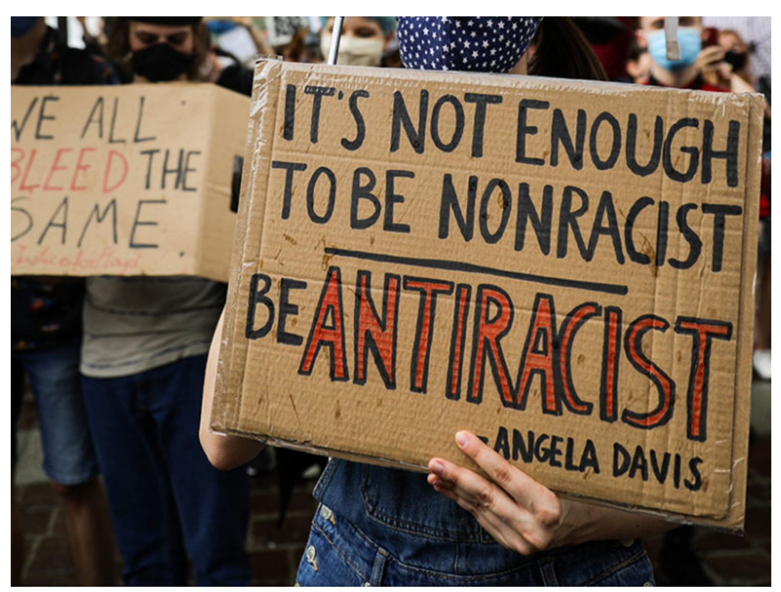
Signs at a 7 June protest in Krakow, Poland, affirm that Black lives matter and call for racial justice reform.

To be silent is to be complicit in our own destruction because racism destroys us all. But not being silent entails more than publishing statements. There is also the collective silence of inaction. —No Time for Silence